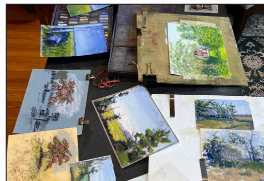
Plein Air sketches ready for critique